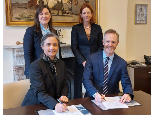
The Memorandum of Understanding between IHRB and VCI was signed on 7th February 2023