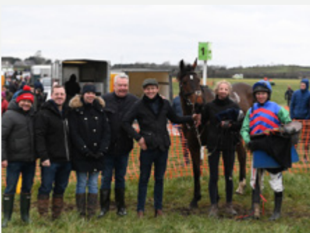
Drumnasoo, winner of the 6yo & Up Maiden at North Down (F) Kirkistown – 8 February

Congratulations to all the winning connections of INHSC sponsored races and bonuses during the Spring 2025 Season: