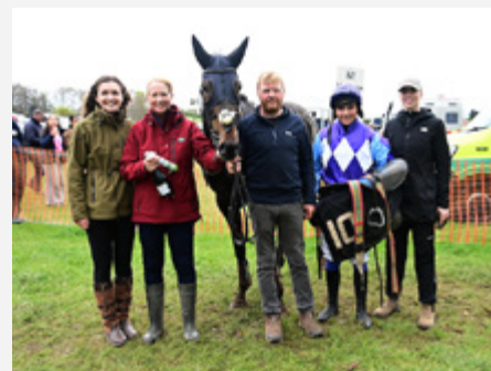
Peppers Corner, winner of the 6yo & Upwards Mares Maiden at East Antrim (H) Loughanmore – 21 April