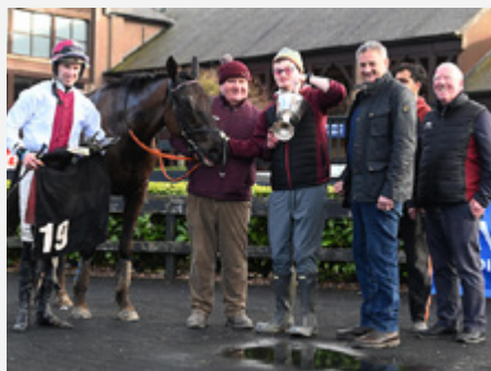
Minella Mission, winner of the 6yo & Upwards Geldings Maiden at Kildare (F) Punchestown – 22 February