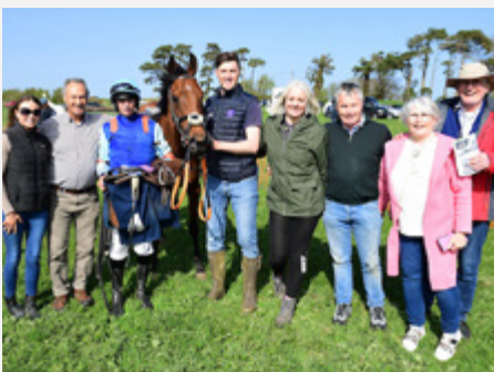
Black Soul, winner of the 6yo & Up Maiden at Co. Limerick (F) Athlacca – 6 April