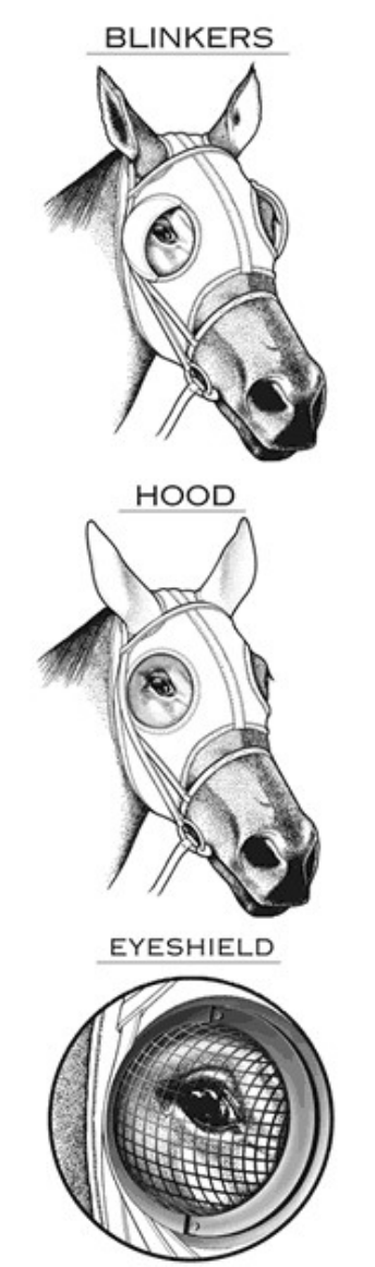
(May also be made of a transparent material. However, such eyeshields must have adequate ventilation, and may be unsuitable for use in wet conditions on all weather tracks, where the kickback is liable to stick to the eyeshield)